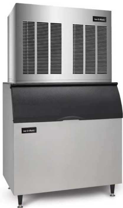
MFI2406 ON BIOO