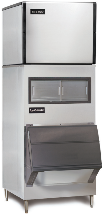
ICEO856 ON B700-30